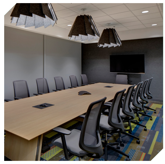
Unclassified conference room space.