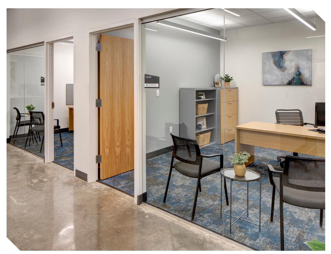
Management office area of the Westway St. Louis facility.

WESTWAY OFFERS SERVICE AGREEMENTS, not commercial leases, because what we provide is more than just square feet inside of a building. We supply fully furnished, ICD 705 compliant, turnkey space that includes a full suite of amenities and security services which far surpass what any other commercial office or ICD 705 space offers.